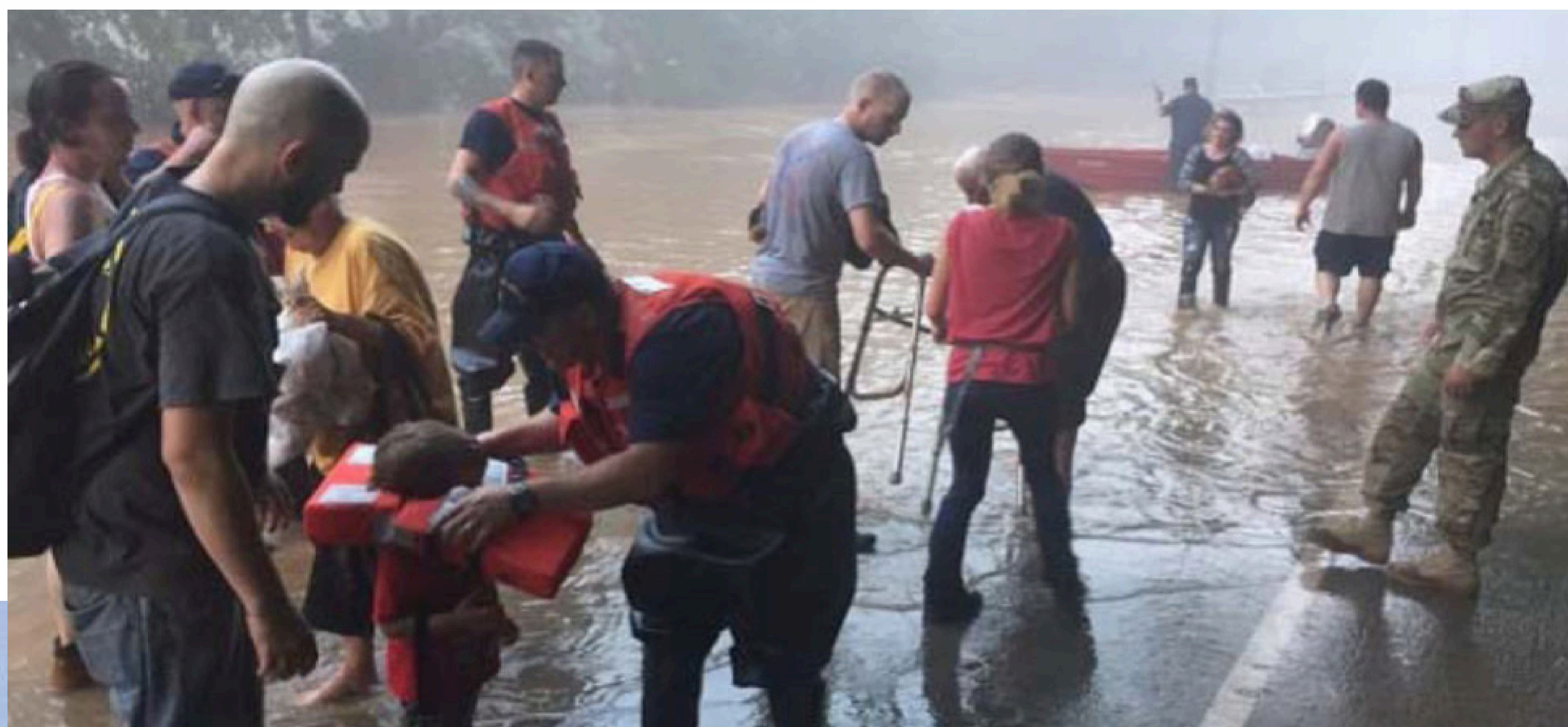
Coast Guard Marine Safety Unit Huntington Western River Flood Punt Team providing lifejackets to locals near Clendenin, West Virginia, June 24, 2016.