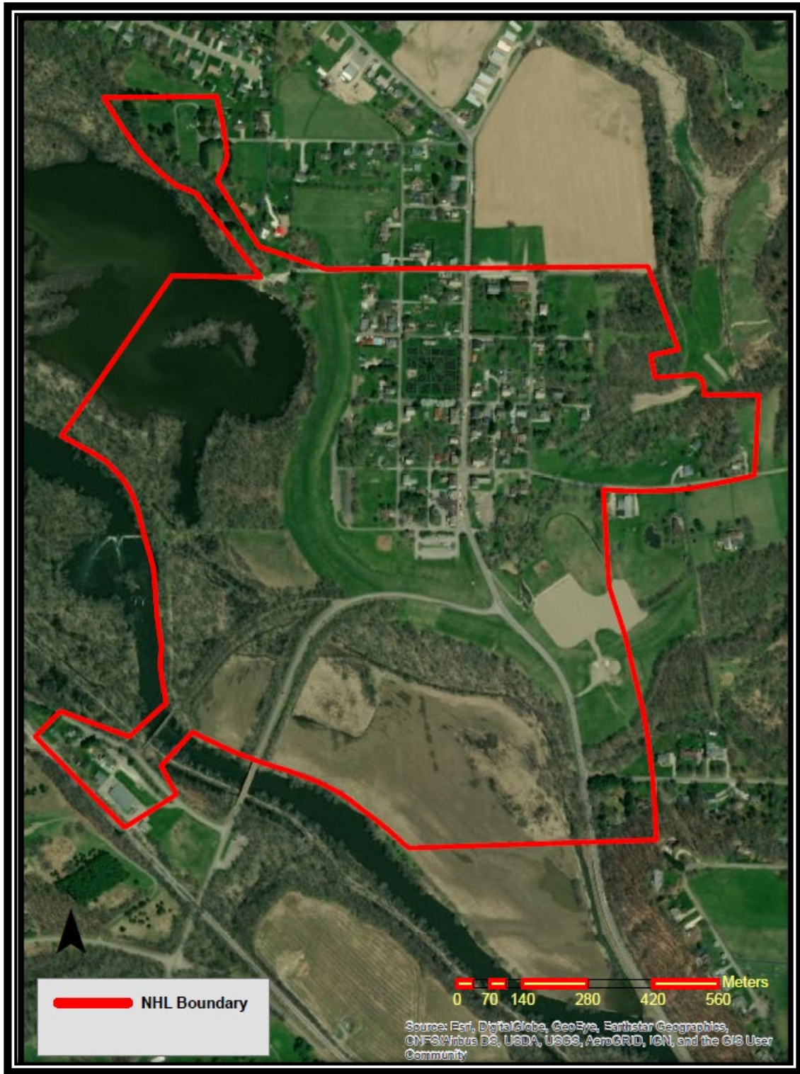
Figure 2. NHLD Boundary